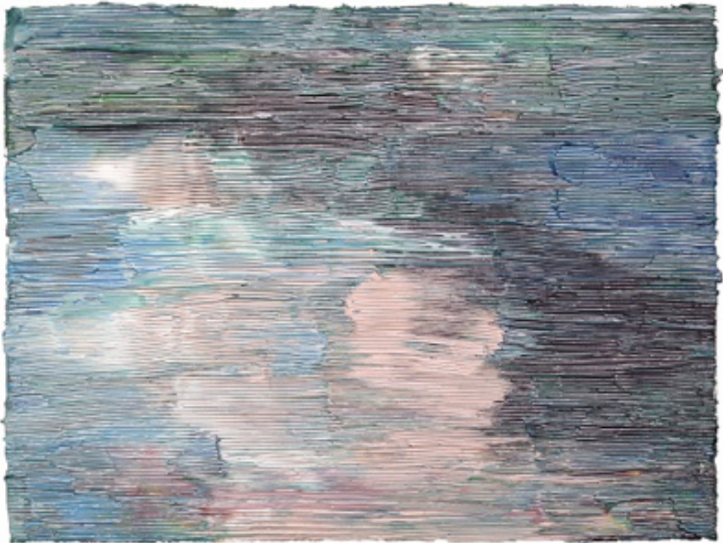
JIA PENG , Invisible No. 19 , Acrylic on canvas, 30 x 40 cm, 2015

Images: LAILA AZRA , Dream , Mixed media on canvas, 80 x 80 cm, 2015 JIA PENG , Invisible No. 31 , Acrylic on canvas, 40 x 30 cm, 2016